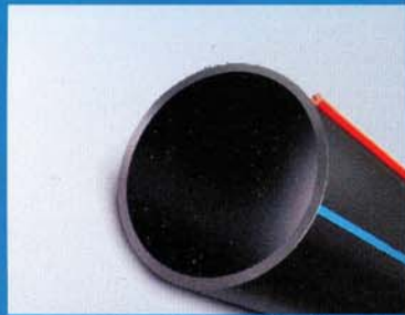
Dura-Trac™—the detectable PE pipe