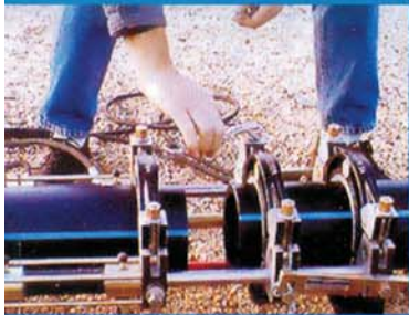
Professional Turnkey Support